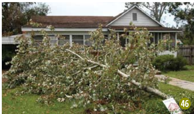
Figure 46 Recently planted trees, such as this red maple, should be treated as a new planting by staking and watering properly.