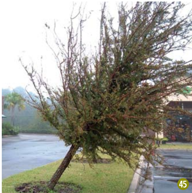
Figure 45 This leaning elm ( Ulmus spp. ) could be stood up and staked.