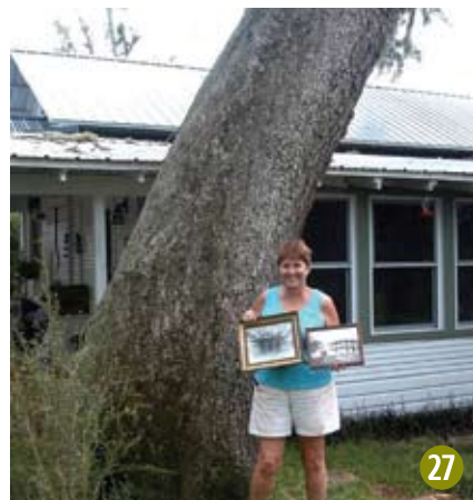
Figure 27 This live oak is part of a historical 1900s hotel, as shown by the owner, located in the Bagdad Village Historic District, Milton, FL.

In addition to the economical value and ecological services that trees provide to the owner and community, the tree in question might be a memorial tree, or it may have a historical significance or some other cultural attribute associated with it (Figure 27).