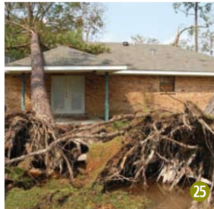
Figure 25 The high water table at this site restricted root depth and saturated soil allowed roots to slide in the soil, making these pines topple over during a hurricane.

Soil compaction, shallow soils, hardpans and a high water table restrict roots to shallow depths and can result in unstable trees (Figure 25).