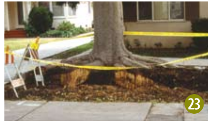
Figure 23 Construction is especially damaging to roots, such as these roots cut during curb repair.

The importance of root integrity and health cannot be overemphasized. In addition to absorbing water and essential elements, roots anchor the tree. If roots are damaged in any way, the likelihood of failure increases (Figure 23). Construction activities within about 20 feet of the trunks of existing trees can cause the trees to blow over more than a decade later.