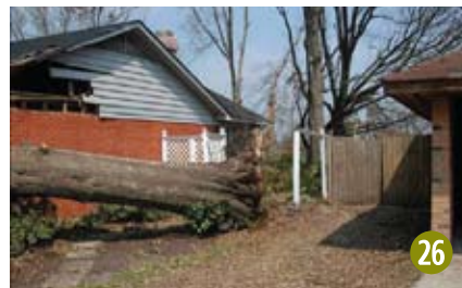
Figure 26 These white oak roots were confined by the buildings around them, probably damaged by construction and compaction, resulting in a root system too small to support such a large tree canopy.

The importance of selecting the right tree for the right location has been greatly stressed, and yet selection of inappropriate trees is one of the most common mistakes observed. For example, the white oak ( Quercus alba ) in Figure 26, which can grow to 100 feet and will develop wide-spreading crowns and numerous horizontal branches.