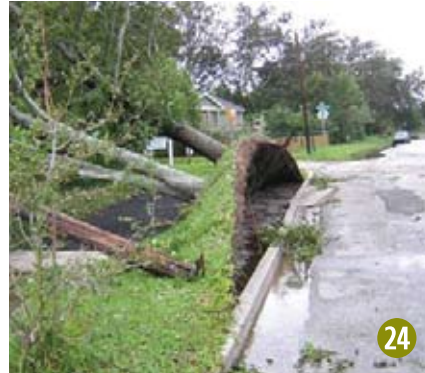
Figure 24 These roots were deflected by the curb and the compacted soil, making them very susceptible to blowing over in the direction away from the curb.

Trees with root systems confined to relatively small soil spaces are not as stable as trees allowed to develop more extensive root systems (Figure 24).