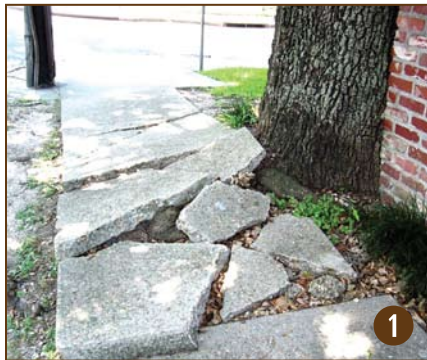
Figure 1 Sidewalk located too close to the root flare of a large tree.

When root pruning is necessary, the general guideline is to preserve all roots within an area about five times the trunk diameter. For example, if the trunk diameter is two feet, than do not prune roots within ten feet of the trunk. Although this will not guarantee that tree will remain erect, it is better than cutting closer to the trunk.