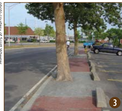
Figure 3 Stone dust is placed around the root flare of the tree in cutouts along this brick sidewalk. This technique is attractive and allows for easy repair as roots expand in diameter.

Surface materials like gravel, limestone, or stone dust allow continued root growth and expansion (Figure 3). The surface can be easily repaired as roots continue to expand in diameter. Crushed rock is inexpensive and easy to install, and the surface is porous. It is best used on fairly flat surfaces because rain can cause erosion on sloping ground. The use of brick pavers, shown in the picture, provides a route for pedestrians walking from the parking lot to the other side of the street. Displaced stones will need to be replaced occasionally, and may be a nuisance when using equipment such as a leaf blower (Gibbons, 1999).