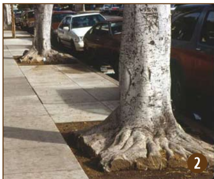
Figure 2 Main supporting roots were cut. These trees, once of value to the landscape, are now at high risk for failure and should be removed before they fall over.