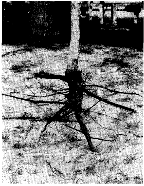
Figure 1. Root system inside the root ball of trees collected from the wild was dominated by a single tap root. Large, horizontal lateral roots and fine roots grew from the tap root close to the surface of the soll.

The field-grown nursery trees did not have a single prominent tap root, but several large roots grew straight or at a slight angle down beneath the trunk on most trees (Figure 2). In most cases these