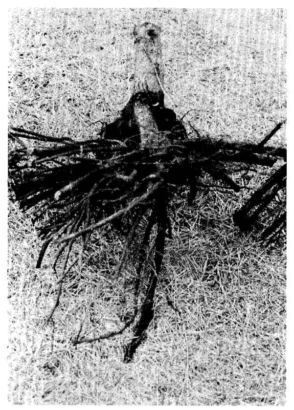
Figure 2. Root system inside the root ball of field-grown nursery trees showing a large number of horizontal lateral roots and some nearly vertical deep roots. Fine roots are located at the top right hand side of the root ball.

vertically-oriented roots originated from roots which had circled the bottom of the container prior to planting in the nursery. Vertically-oriented roots were generally larger in diameter than other roots. There were only a few fine roots growing from these deeper roots; most fine roots arew from the shallower horizontally-oriented laterals. The plastic bottom of the fabric containers prevented the development of roots deeper than the depth of the fabric container (36 cm) (Figure 3). Smallerdiameter, horizontally-oriented, lateral roots grew from the 'cage' of roots which formed at the edge of the container prior to planting into the nursery. The 'cage' was 15 cm deep and wide (which are the dimensions of the 3.8 liter nursery container from which trees were planted) and was formed when lateral roots circled the side and bottom of the container after hitting the container walls. As the trees grew in the nursery, these roots increased