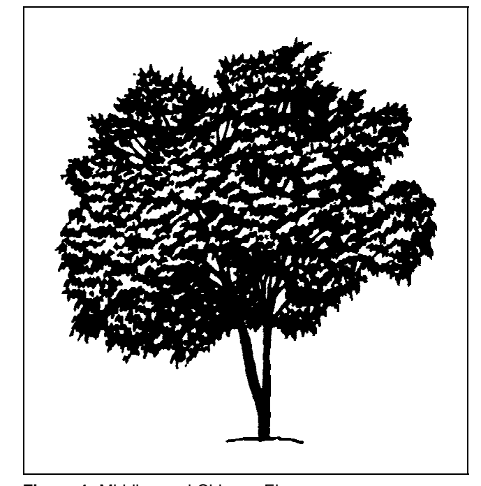
Figure 1. Middle-aged Chinese Elm.

medium-sized parking lot islands (100-200 square feet in size); medium-sized tree lawns (4-6 feet wide); recommended for buffer strips around parking lots or