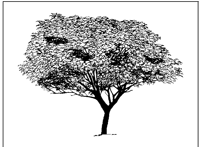
Figure 1. Middle-aged Yellow Poinciana.

Availability: somewhat available, may have to go out of the region to find the tree