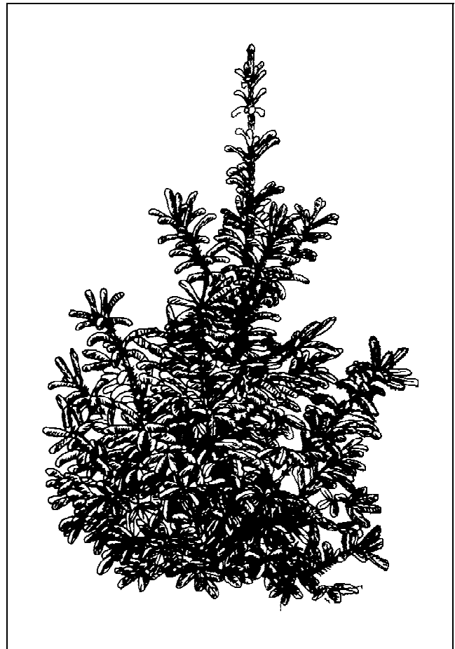
Figure 1. Young White Spruce.