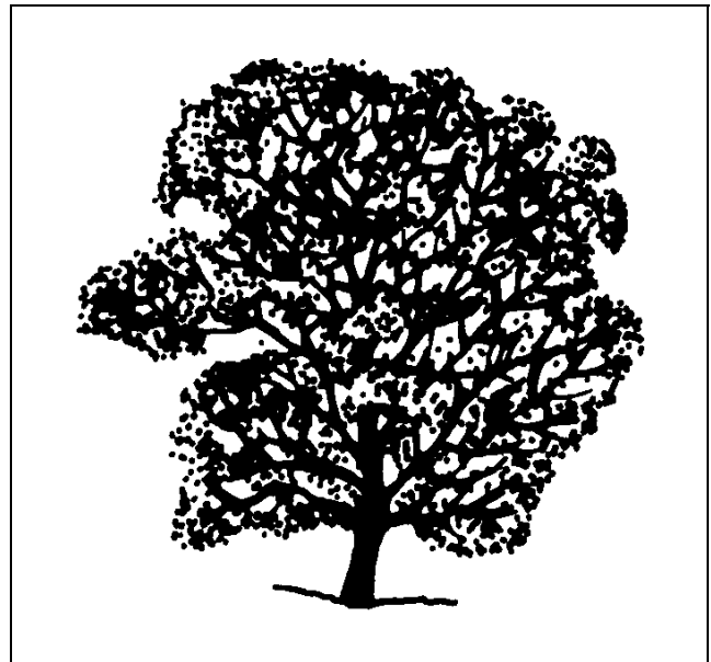
Figure 1. Mature Pinkball.