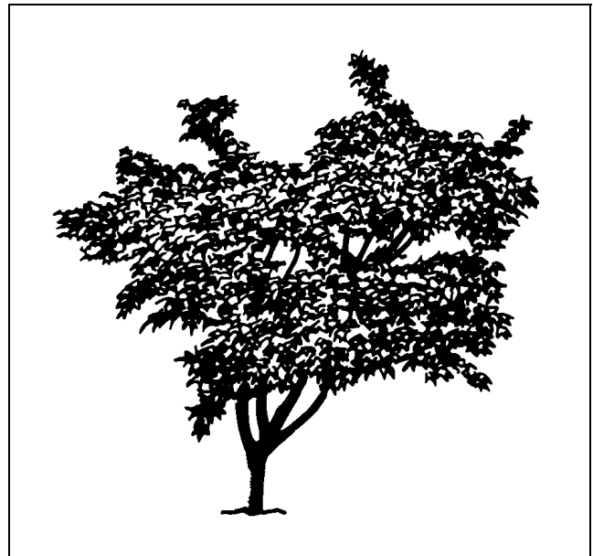
Figure 1. Young 'Atropurpureum' Japanese Maple.

Height: 15 to 25 feet Spread: 15 to 25 feet Crown uniformity: symmetrical canopy with a regular (or smooth) outline, and individuals have more or less identical crown forms