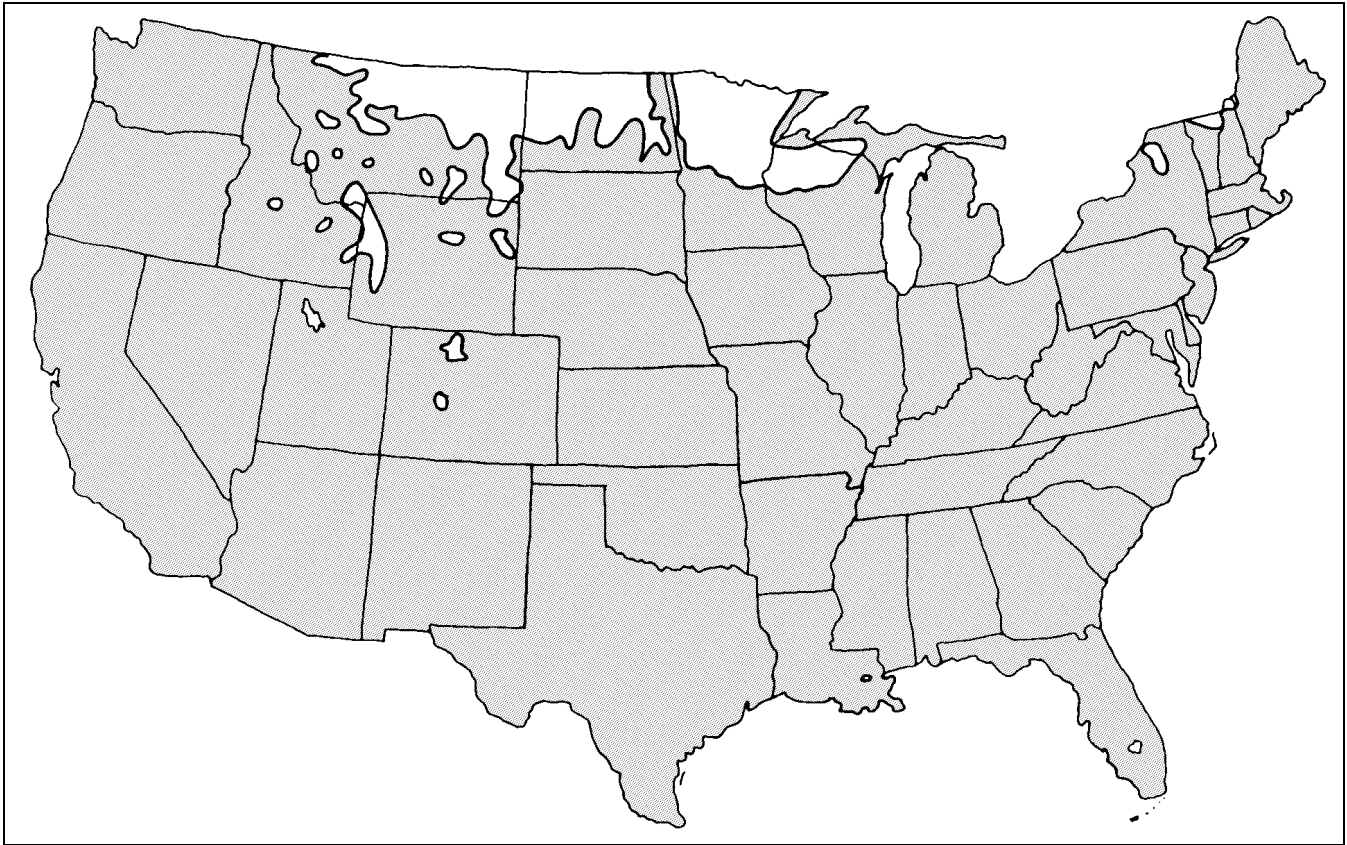
Figure 2. Shaded area represents potential planting range.