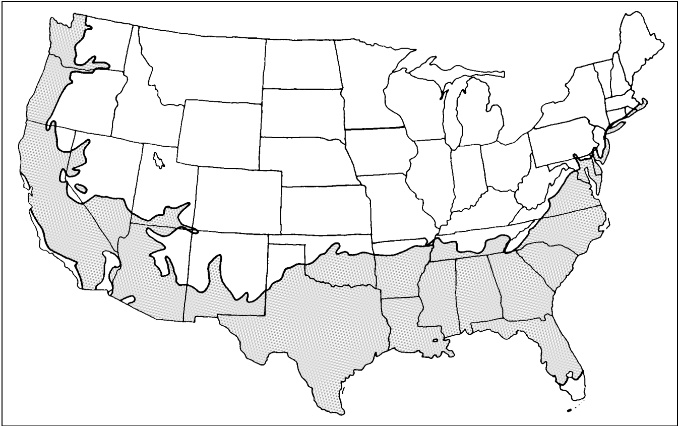
Figure 2. Shaded area represents potential planting range.