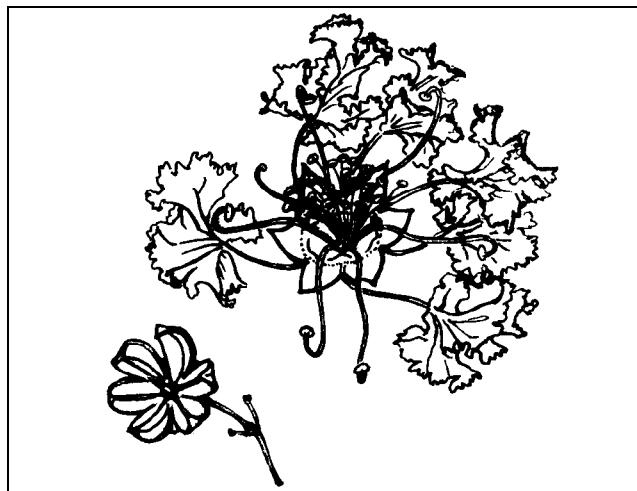
Figure 3. Flower of 'Dallas Red' Crape-myrtle

Crape-Myrtle grows best in full sun with rich, moist soil but will tolerate less hospitable positions in the landscape just as well, once it becomes established. It grows well in limited soil spaces in urban areas such as along boulevards, in parking lots, and in small pavement cutouts if provided with some irrigation until well established. They tolerate clay and alkaline soil well. However, the flowers of some selections may stain car paint. Insect pests are few but Crape-Myrtle is susceptible to powdery mildew damage, especially when planted in some