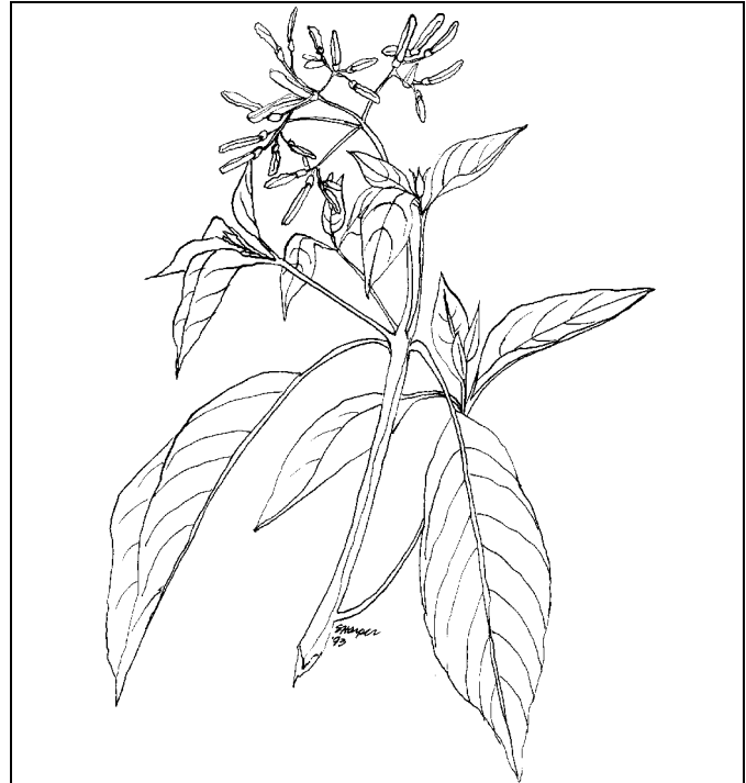
Figure 1. Firebush.

Uses: specimen; accent; screen; border; mass planting; attracts butterflies; attracts hummingbirds