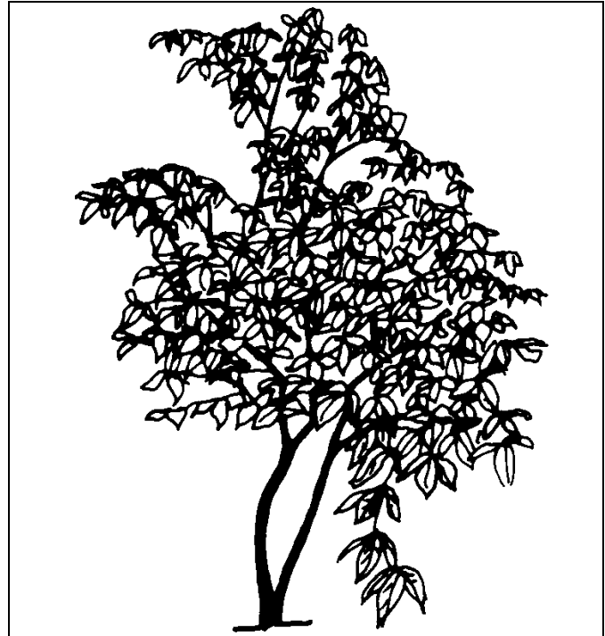
Figure 1. Bottlebrush Buckeye.