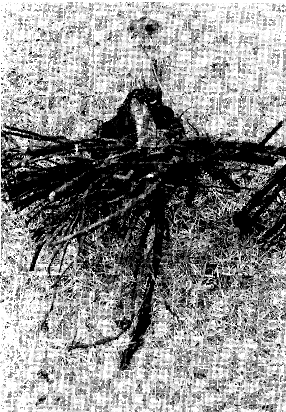
Figure 2. Root system inside the root ball of field-grown nursery trees showing a large number of horizontal lateral roots and some nearly vertical deep roots. Fine roots are located at the top right hand side of the root ball.

vertically-oriented roots originated from roots which had circled the bottom of the container prior to planting in the nursery. Vertically-oriented roots were generally larger in diameter than other roots. There were only a few fine roots growing from these deeper roots; most fine roots grew from the shallower horizontally-oriented laterals. The plastic bottom of the fabric containers prevented the development of roots deeper than the depth of the fabric container (36 cm) (Figure 3). Smaller-diameter, horizontally-oriented, lateral roots grew from the 'cage' of roots which formed at the edge of the container prior to planting into the nursery. The 'cage' was 15 cm deep and wide (which are the dimensions of the 3.8 liter nursery container from which trees were planted) and was formed when lateral roots circled the side and bottom of the container after hitting the container walls. As the trees grew in the nursery, these roots increased