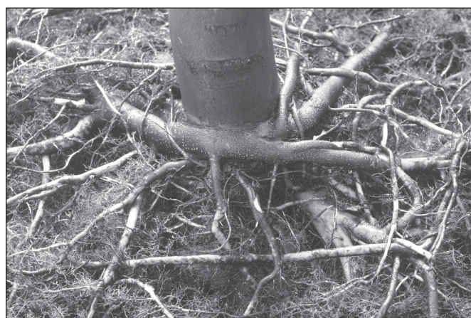
Figure 1. 'Florida Flame' red maple in #45 container showing stem girdling roots hidden by substrate. Substrate surface was just above large SGR touching trunk.

No magnolia or elm had enough roots circling the trunk that were visible at substrate surface to rate any tree a cull (Table 3). However, once substrate was washed from roots it was clear many trees were culls meaning that roots with a diameter greater than one-tenth the trunk caliper circled more than one-third around the trunk. Some maple trees were culls without substrate removed; however, all maples were rated as culls following substrate removal (Table 3; Figure 1). Elms planted deeply into #15 containers were more likely to be culls than trees planted shallow, regardless of planting depth into #3 containers. Presence of visible root flare prior to substrate removal was not related to actual cull rating following substrate removal (Table 3).