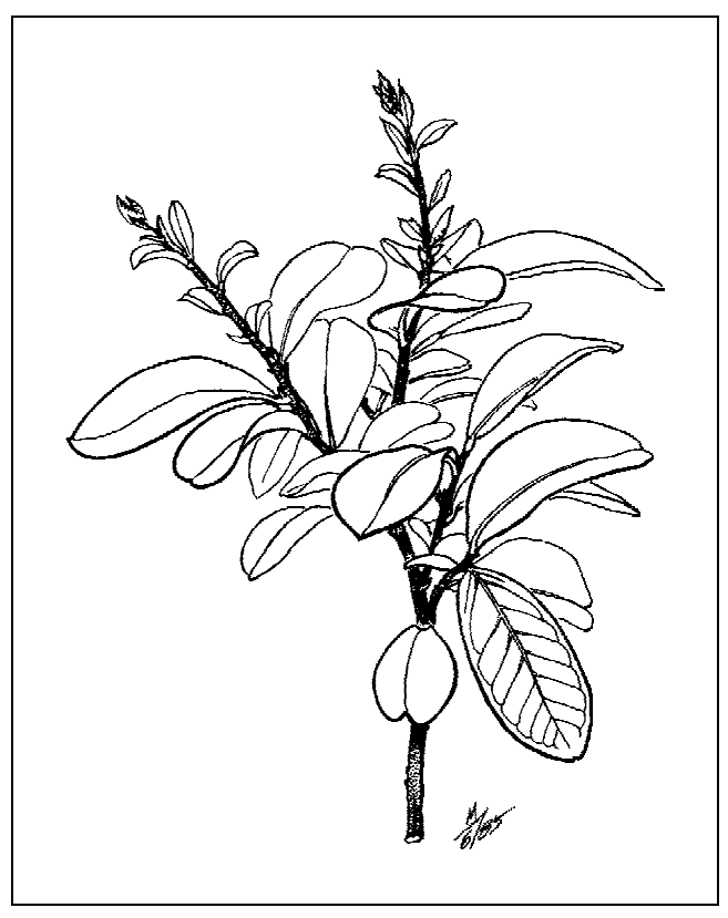
Figure 3. Foliage of 'Natchez' Crapemyrtle.