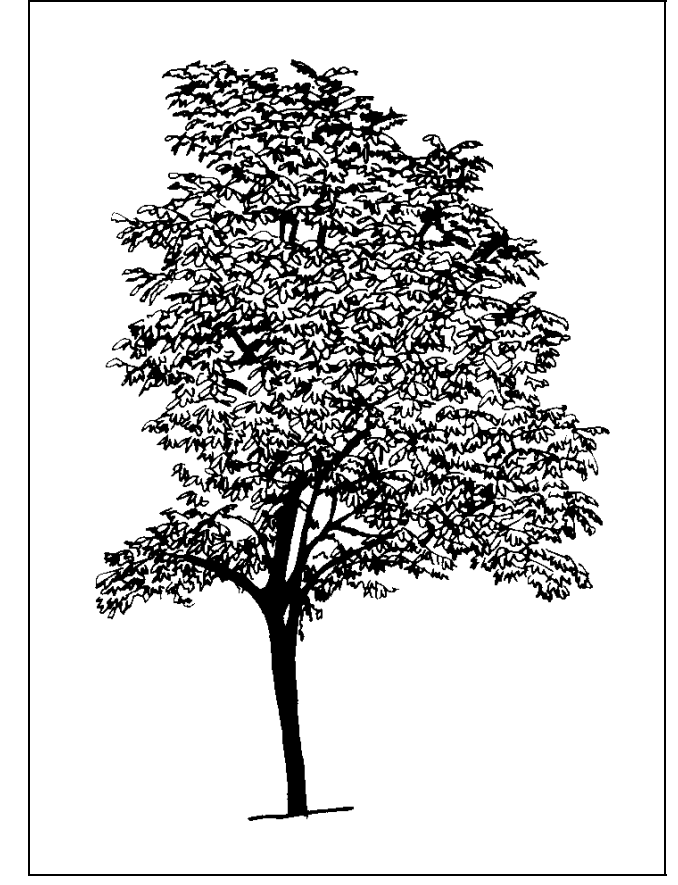
Figure 1. Middle-aged 'Thundercloud' Cherry Plum.