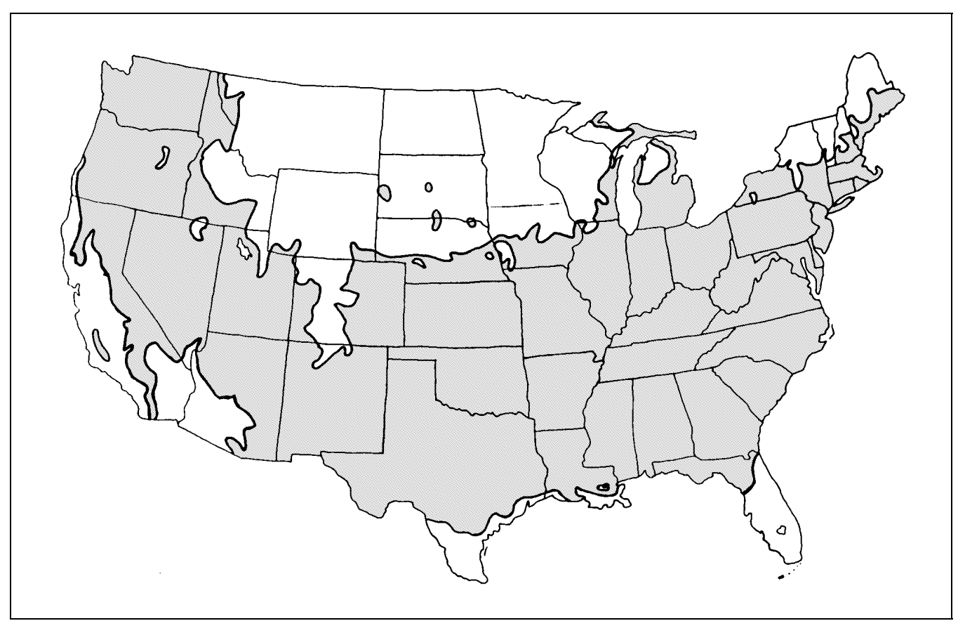
Figure 2. Shaded area represents potential planting range.

Leaf blade length: 2 to 4 inches; less than 2 inches