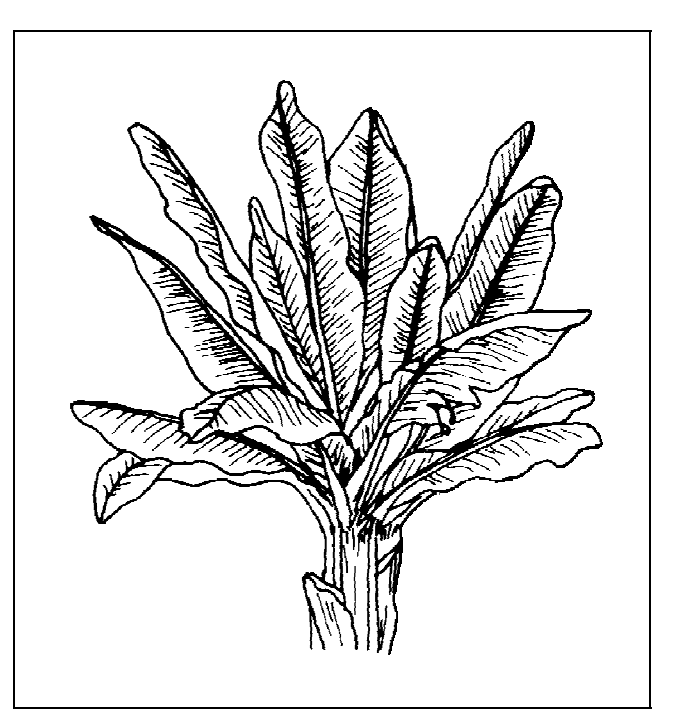
Figure 1. Young Banana.

Height: 10 to 30 feet Spread: 10 to 15 feet Crown uniformity: irregular outline or silhouette Crown shape: palm; upright