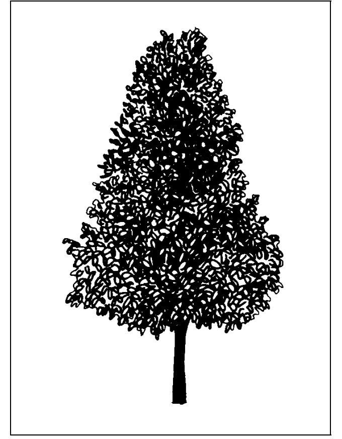
Figure 1. Young 'Goldspire' Sugar Maple.