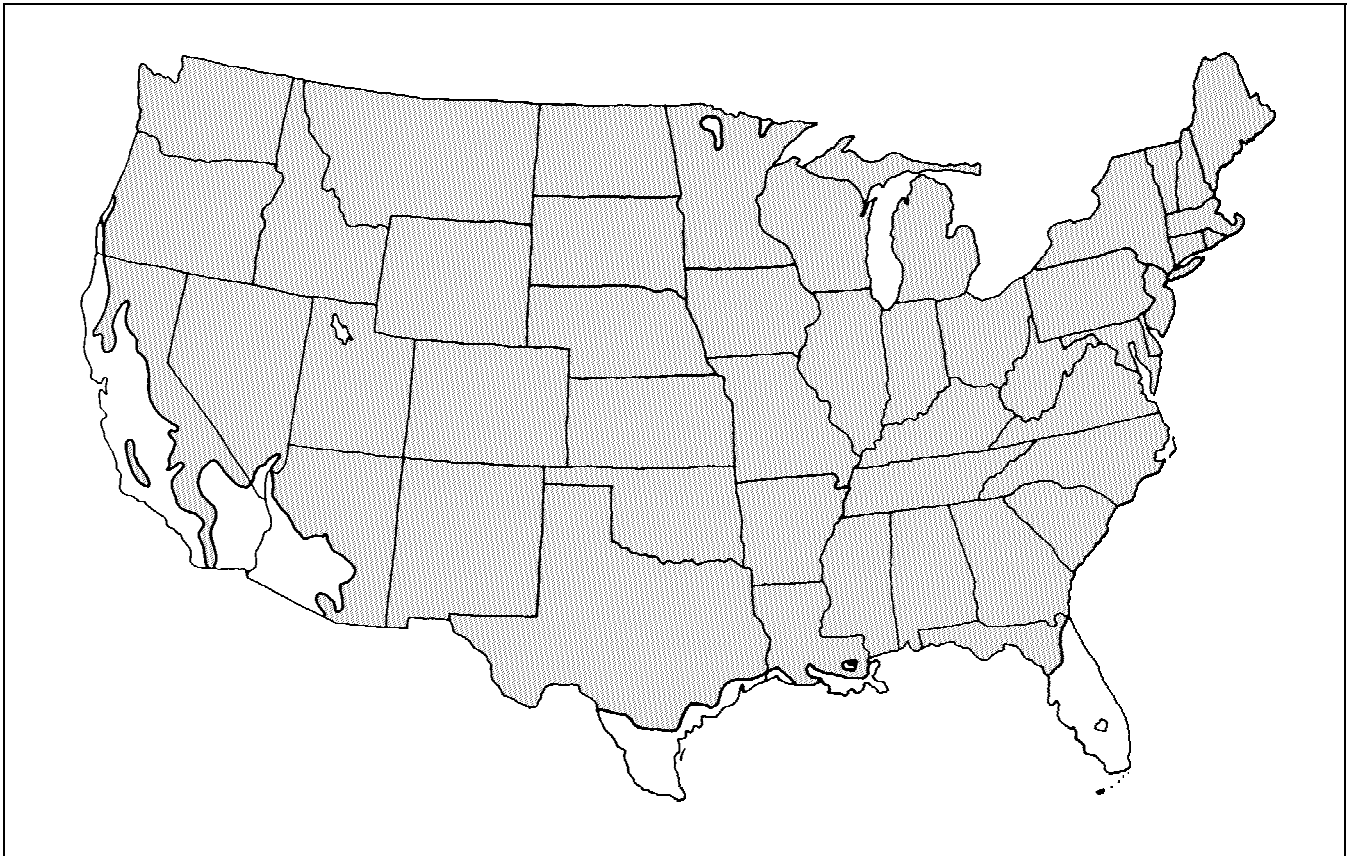
Figure 2. Shaded area represents potential planting range.