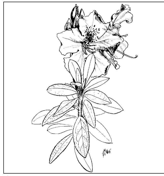
Figure 1. Formosa Azalea.

Height: 10 to 12 feet Spread: 8 to 10 feet Plant habit: round