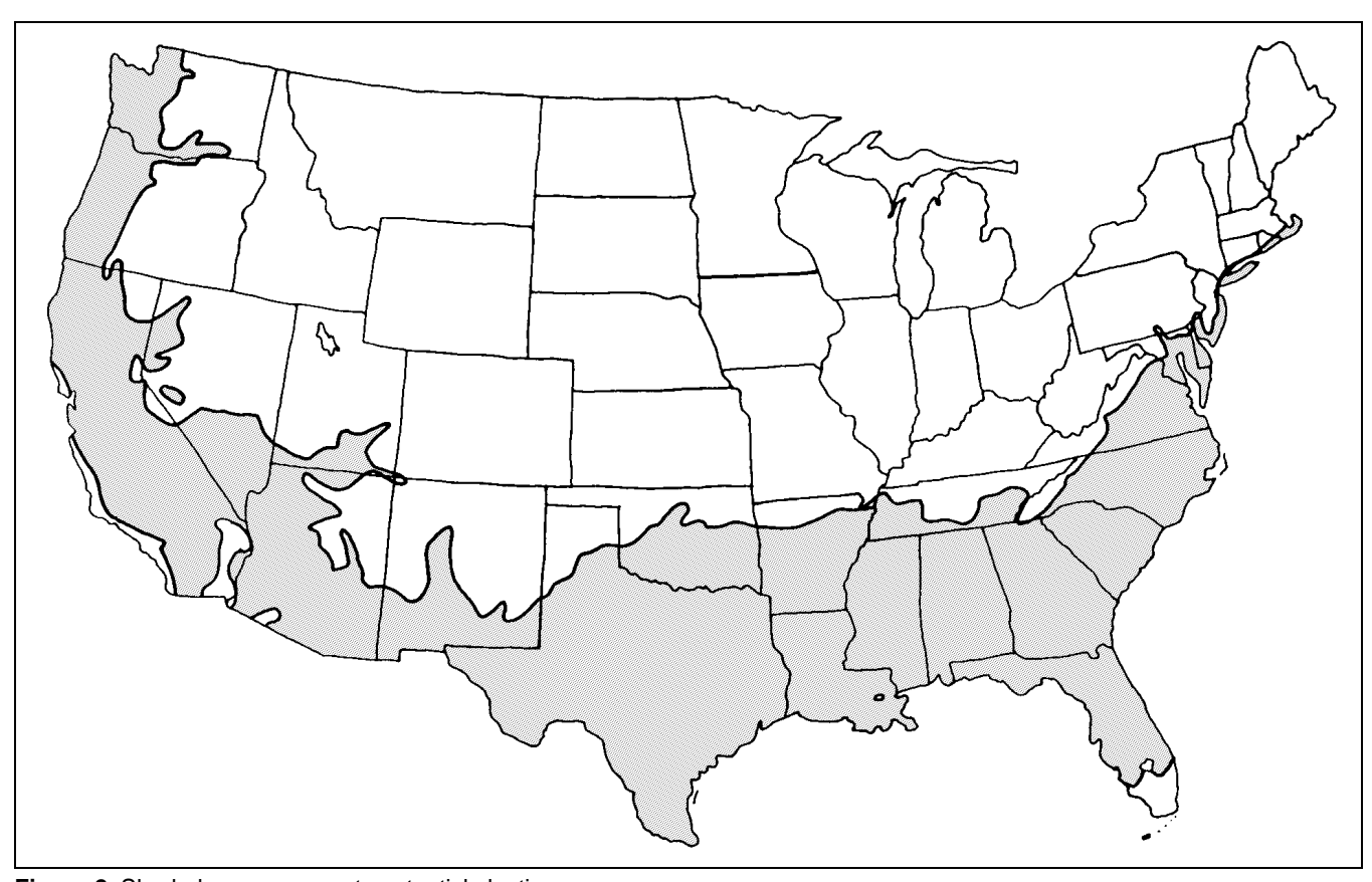
Figure 2. Shaded area represents potential planting range.