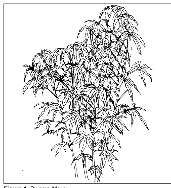
Figure 1. Swamp-Mallow.