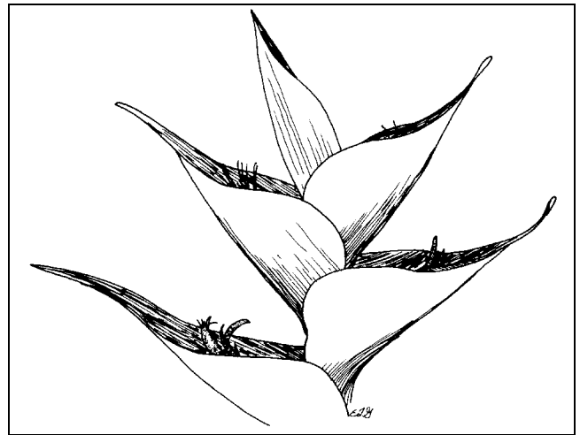
Figure 3. Flower of Caribbean Heliconia

This plant is bothered by Cercospora and Helminthosporium leaf spots. Scales and nematodes may also cause problems.