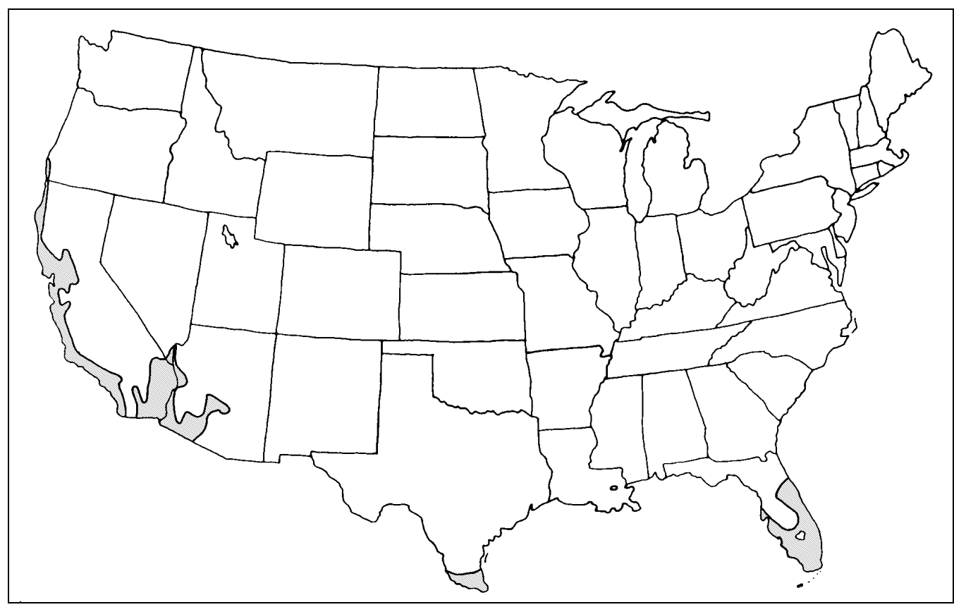
Figure 2. Shaded area represents potential planting range.