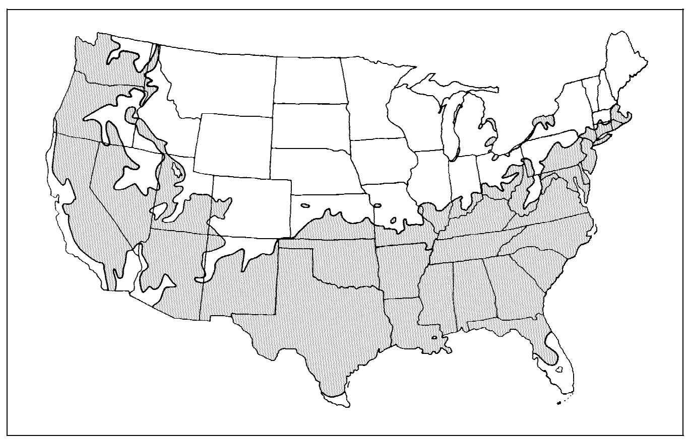
Figure 2. Shaded area represents potential planting range.