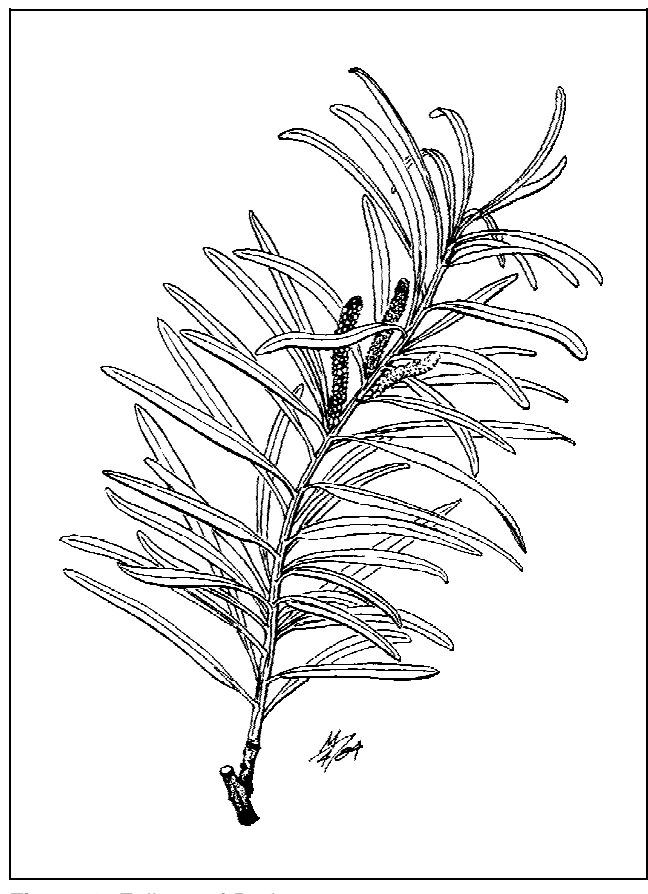
Figure 3. Foliage of Podocarpus.