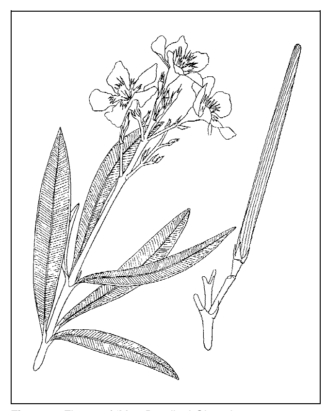
Figure 3. Flower of 'Mrs. Roeding' Oleander.