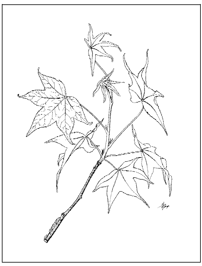
Figure 3. Foliage of Sweetgum.