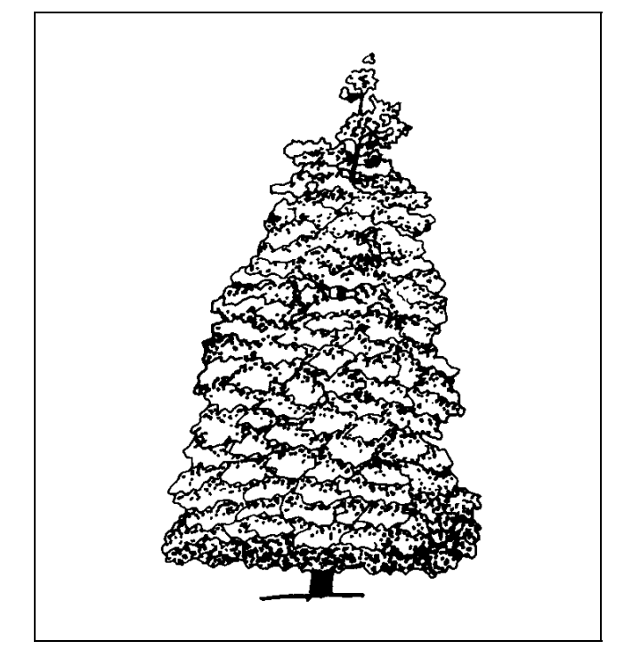
Figure 1. Middle-aged 'Calloway' American Holly.