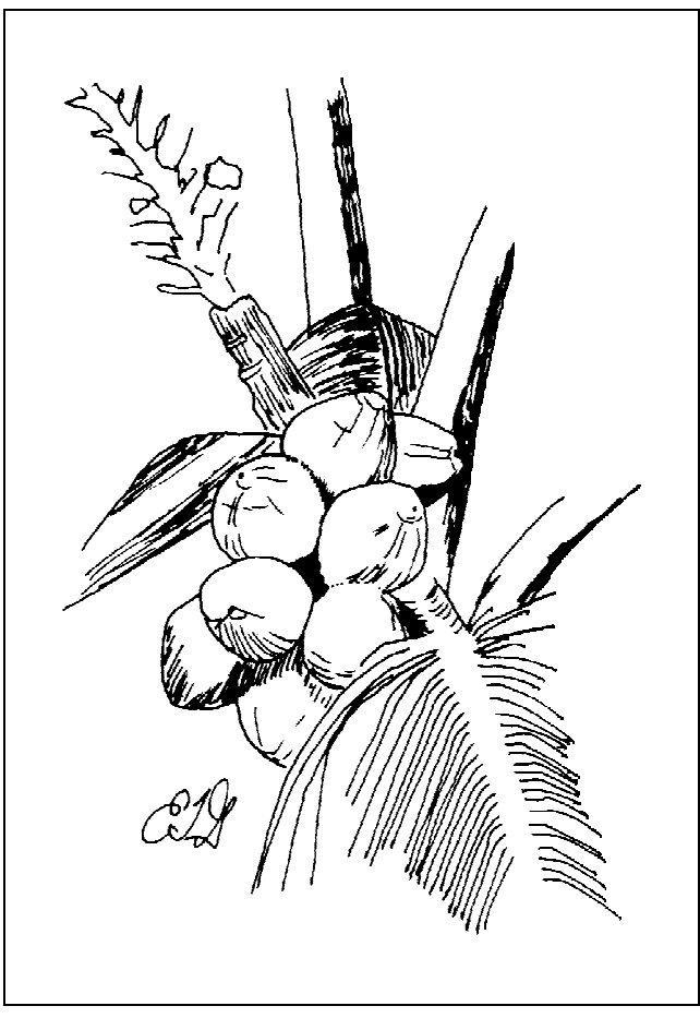
Figure 3. Fruit of Coconut Palm.