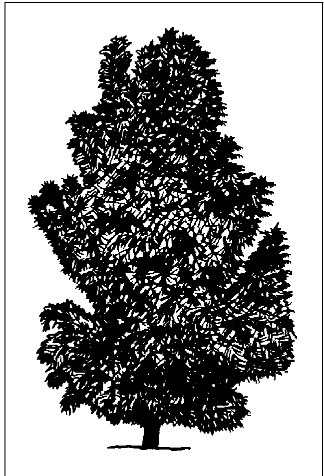
Figure 1. Middle-aged 'Bowhall' Red Maple.

Uses: Bonsai; wide tree lawns (>6 feet wide); medium-sized tree lawns (4-6 feet wide); recommended for buffer strips around parking lots or for median strip plantings in the highway; reclamation plant; screen; residential street tree