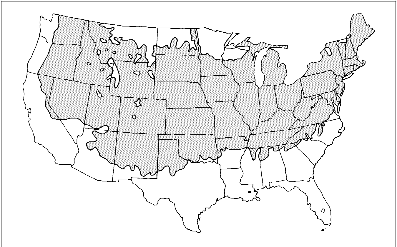
Figure 2. Shaded area represents potential planting range.

Availability: somewhat available, may have to go out of the region to find the tree