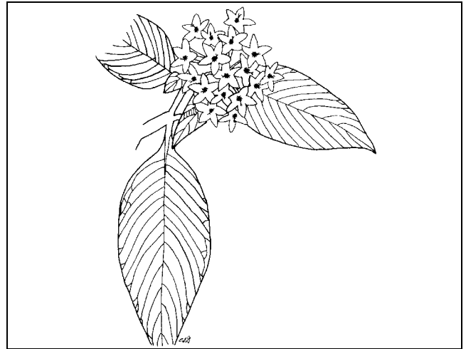
Figure 3. Foliage of Pentas

No pests or diseases are of major concern, but occasionally mites. Caterpillars sometimes chew on the foliage.