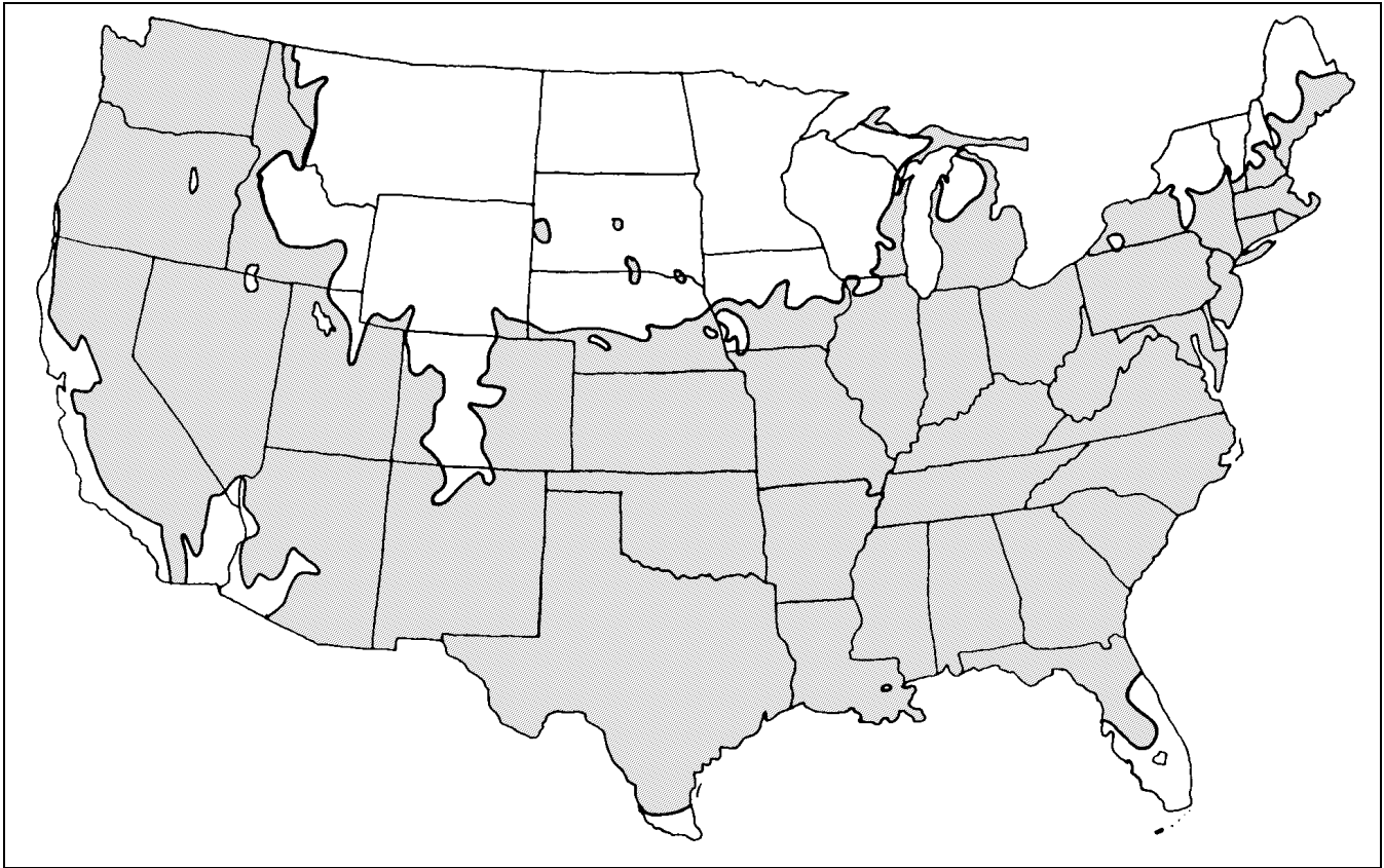
Figure 2. Shaded area represents potential planting range.