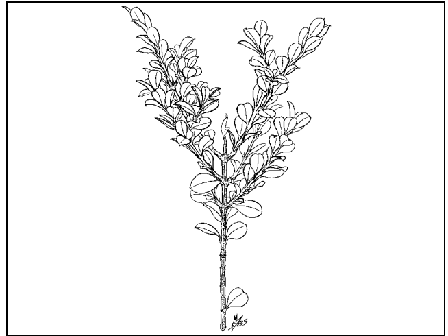
Figure 3. Foliage of Littleleaf Boxwood